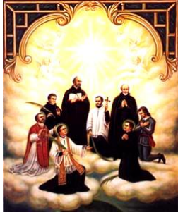
North American Martyrs