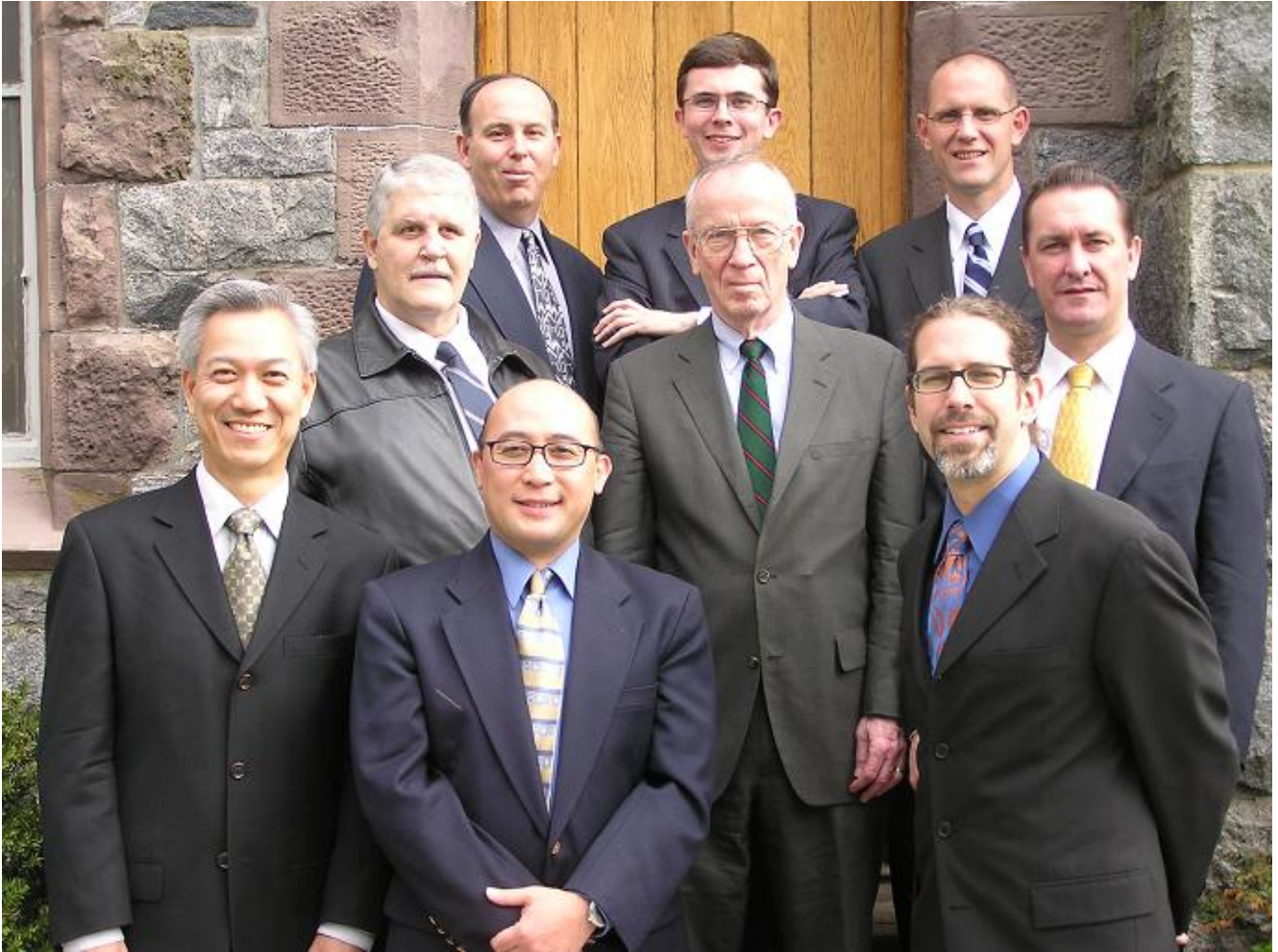
The founding members of the schola after Mass of the Third Sunday after Easter, April 2007.